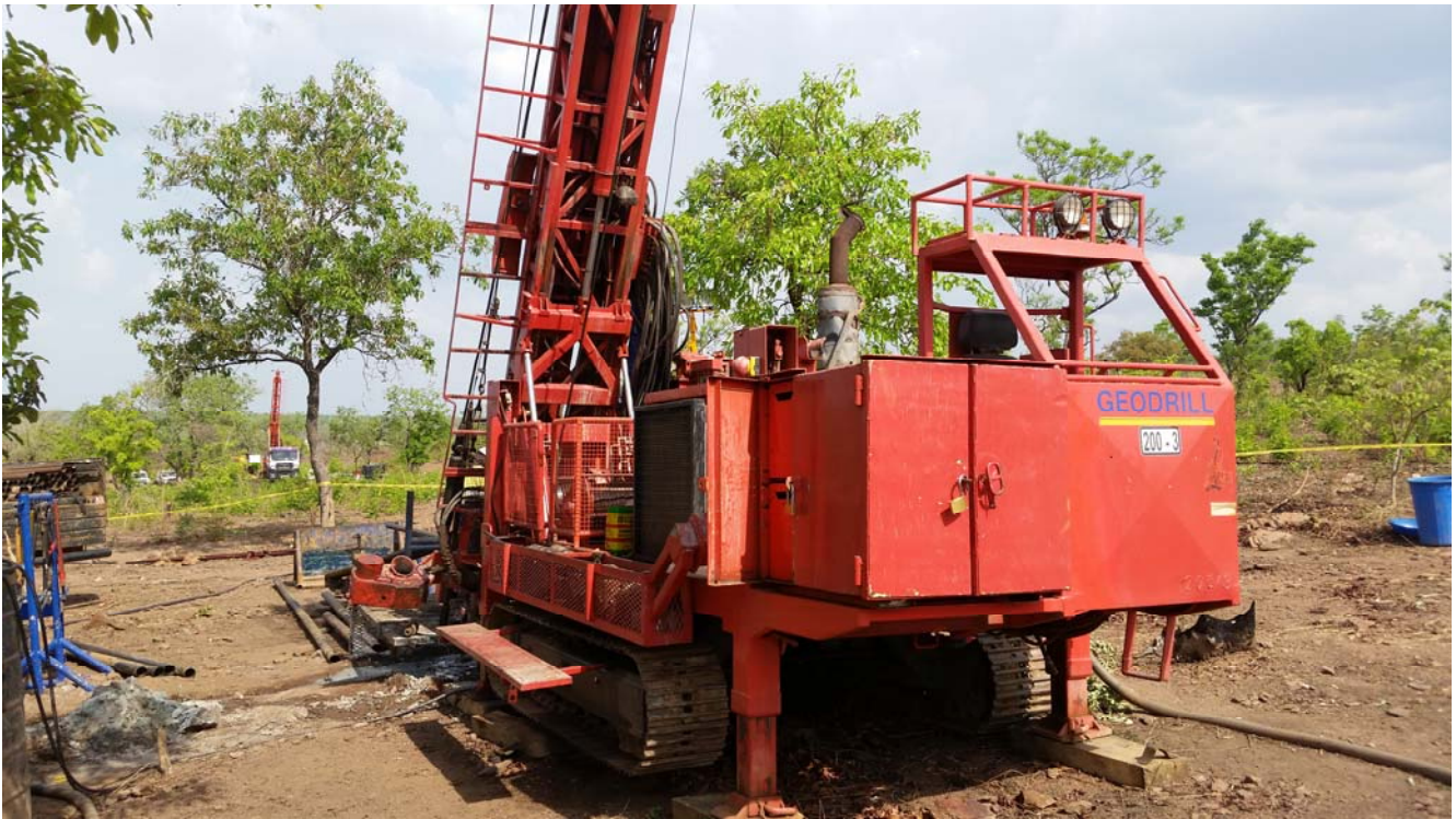
Figure 4: Geodrill Rig (foreground) and AMS Rig (background) at Namdini