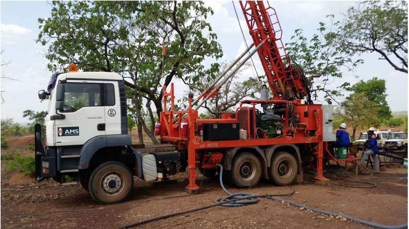
Figure 2: African Mining Services (AMS) Drill Rig on site at Namdini