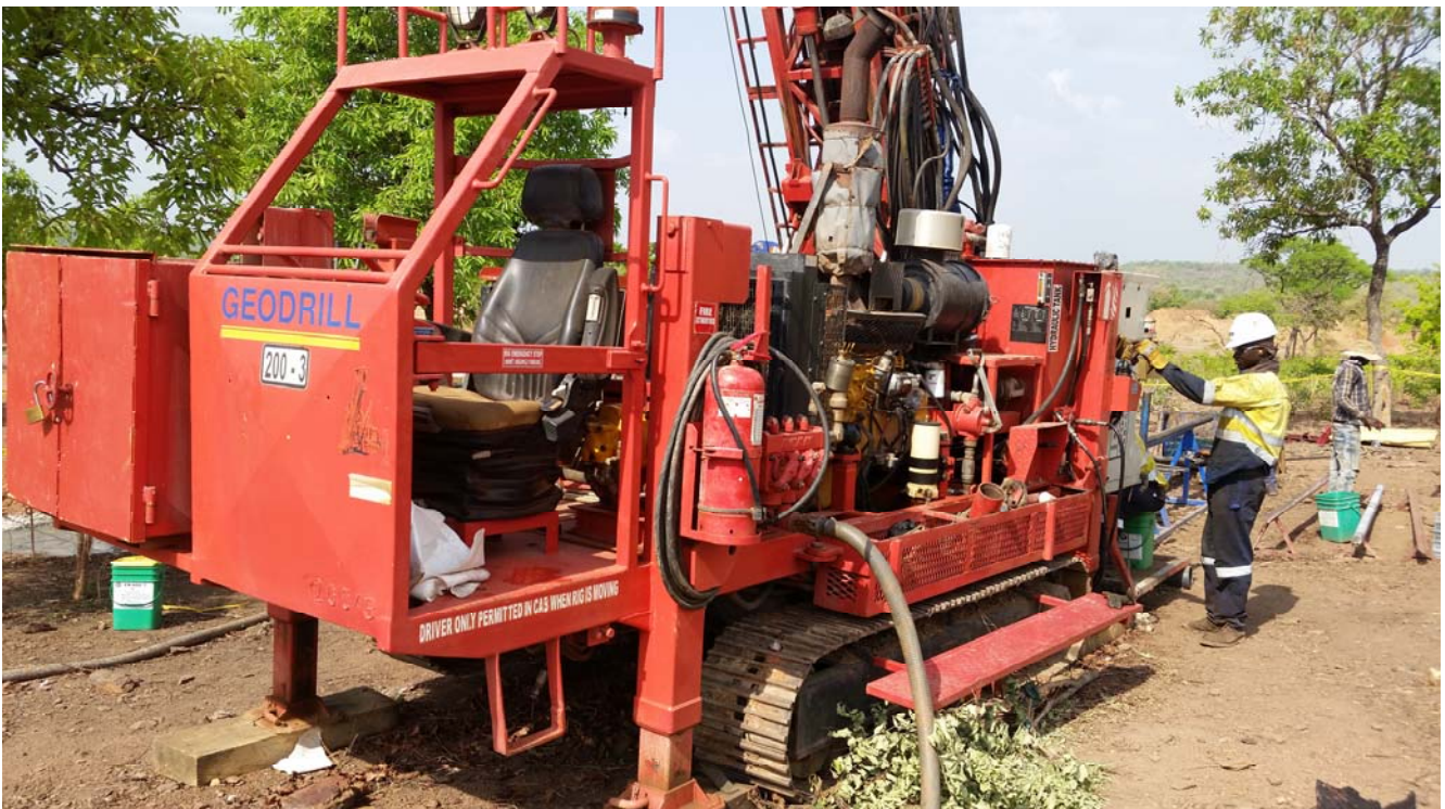
Figure 3: Geodrill Limited Drill Rig on site at Namdini

Cardinal Resources Limited ABN 56 147 325 620