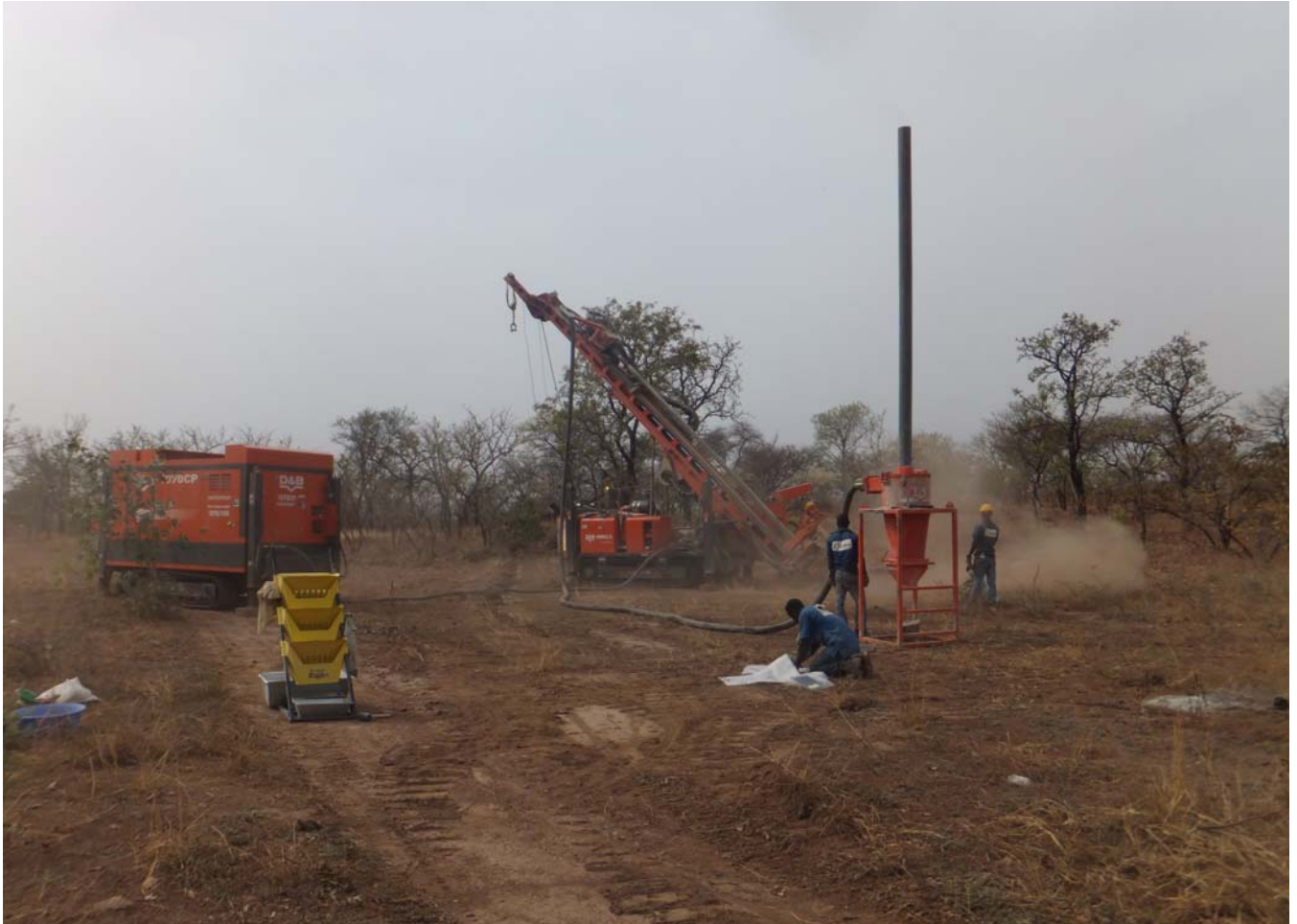
Figure 3: Drilling underway at Ndongo prospect, Bolgatanga Project, Ghana

RC drilling will be undertaken along the DDIP lines (Figure 2) inclined at -45^{\circ} , at 25 -50m spacing and 30 - 50m inclined depths, where fresh rock is anticipated.”