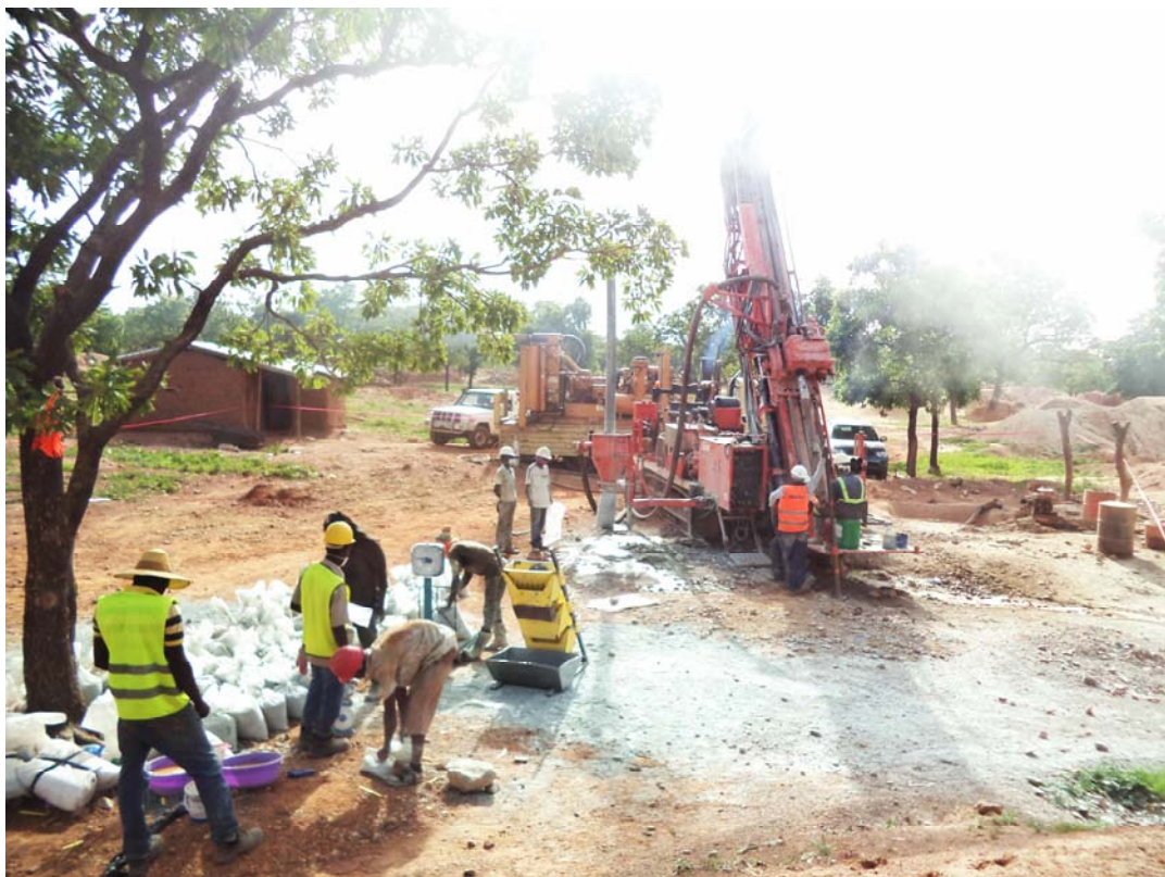
Figure 4: Minerex RC drill rig and RC samples on site at Namdini