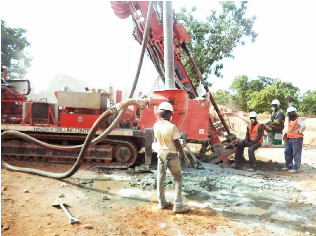
Figure 3: Minerex Drilling Contractors RC Drill Rig on site at Namdini